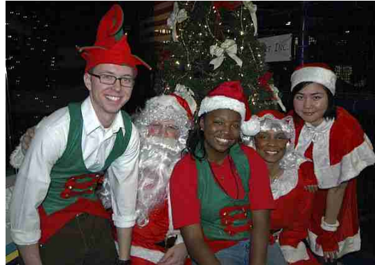
071205-N-15120-100 VIRGINIA BEACH, Va. (Dec. 4, 2007) Members of the Morale Welfare and Recreation (MWR) committee aboard the multi-purpose amphibious assault USS Bataan (LHD 5) bring Santa, Mrs. Claus and their elves to life at the command's children's holiday party at the Haygood Skating Center. The ship's MWR committee hosted the party.